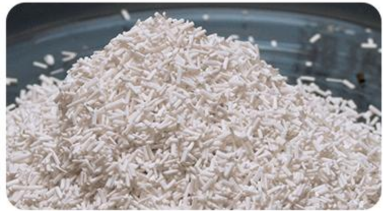
Aluminum based lithium adsorbent