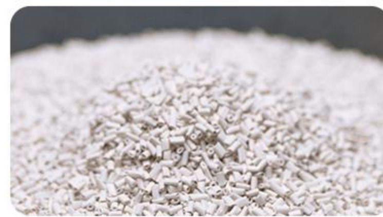
Aluminum based lithium adsorbent